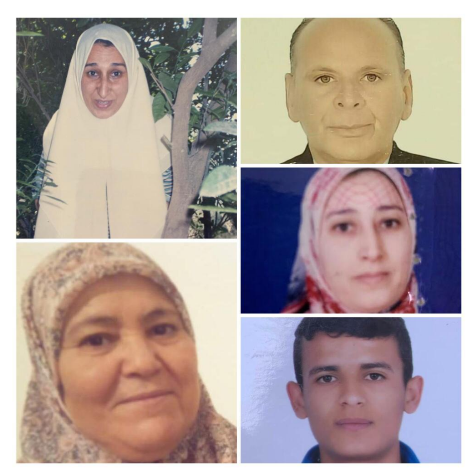
Some of the victims of the strike on the Abu Salim neighbourhood.

The rockets used in this strike on the Abu Salim neighbourhood are notoriously inaccurate. They cannot be aimed precisely at specific targets and should therefore never be used in populated residential areas. Those who launched these strikes would have known that the likelihood of harming civilians was very high. International humanitarian law prohibits indiscriminate attacks (attacks which are not directed at a specific military objective), as well as attacks which employ a method or means of combat which cannot be directed at a specific military objective. Launching an indiscriminate attack resulting in death or injury to civilians constitutes a war crime. <sup>26</sup>