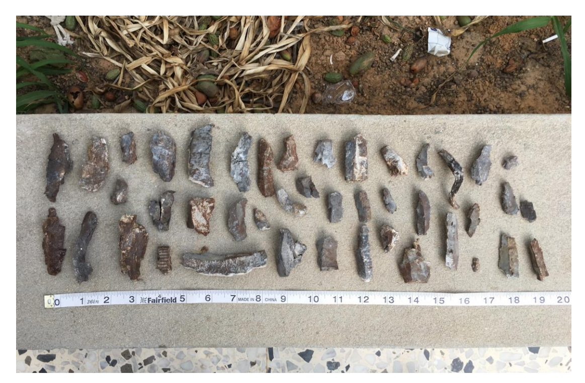
Fragments of an OF-412 100mm artillery projectile, recovered by Amnesty International investigators at the scene of the strike that killed Anwar Mabrouk Mlitan, a 50-year-old carpenter father of six, on the evening of 29 July 2019.