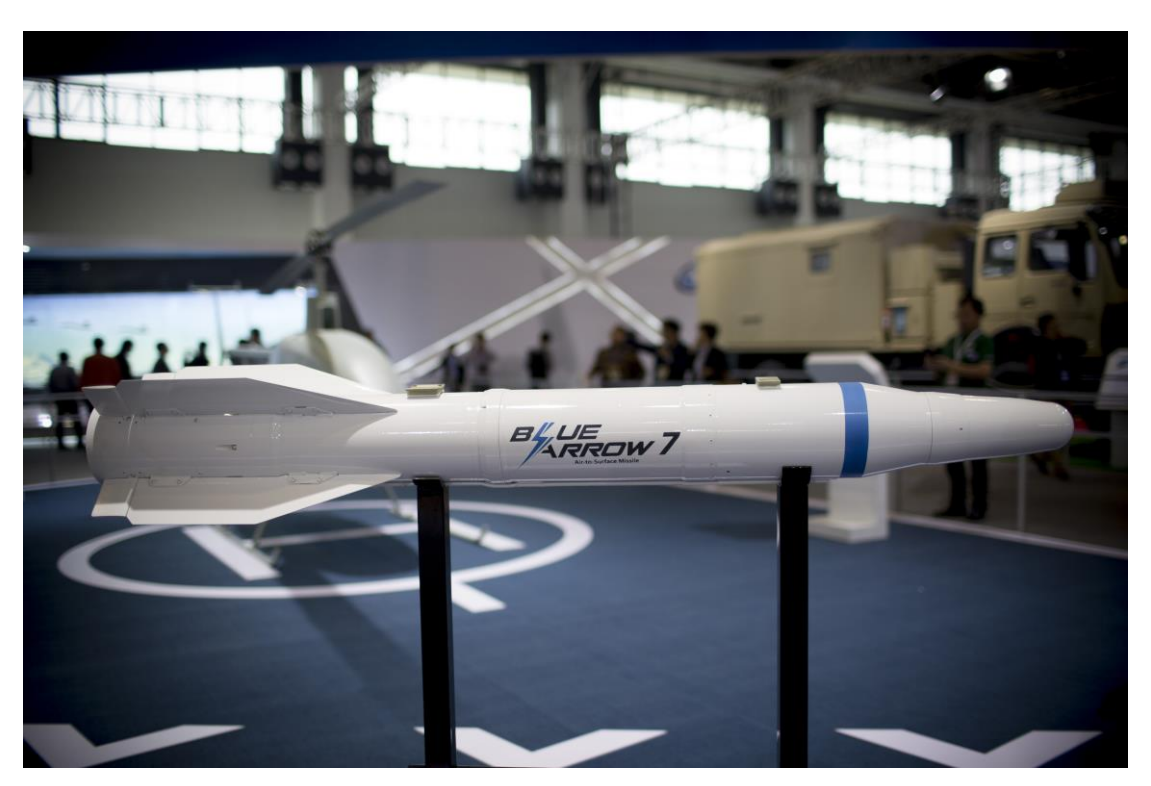
A China North Industries Group Corp. (Norinco) Blue Arrow 7 air-to-surface missile stands on display during the China International Aviation & Aerospace Exhibition in Zhuhai, Guangdong province, China, on Wednesday, Nov. 12, 2014.