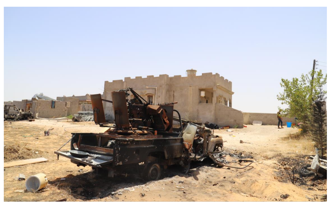
A machine gun mounted on a militia pick up truck destroyed by an LNA strike on a militia base adjacent to a field hospital.

Amnesty International also examined other LNA attacks that struck field hospitals and ambulances, but was unable to conclude whether these had been intentionally targeted and whether these attacks violated international humanitarian law.<sup>53</sup> For example, Amnesty International visited two other field hospitals in the Wadi al-Rabe'a area, south of Tripoli, one in the same compound as a military base which had been attacked by at least two Blue Arrow 7 missiles, and another which was located in the same building as a military command position, which had not been subject to attack. At a third location, in the al-Swani area south of Tripoli, three medics were injured in a 6 June 2019 air strike;<sup>54</sup> fragments recovered at the scene by Amnesty International confirmed that the weapon was a French SAMP 250kg bomb. However, military vehicles with mounted heavy machine guns were observed in satellite imagery near the site prior to the strike. At least two strikes on ambulances examined by Amnesty International, one in the Wadi al-Rabea area and one east of the Airport Highway, are likewise ambiguous, in that fighters in military vehicles were being chased by LNA forces and were very close to the ambulances when these were struck.