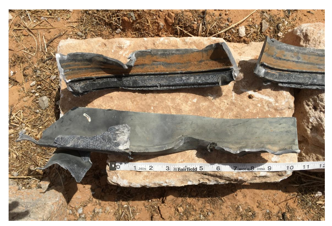
Remnants of the tail section of a FAB-500ShL "parachute" bomb that injured two women in Tarhouna.