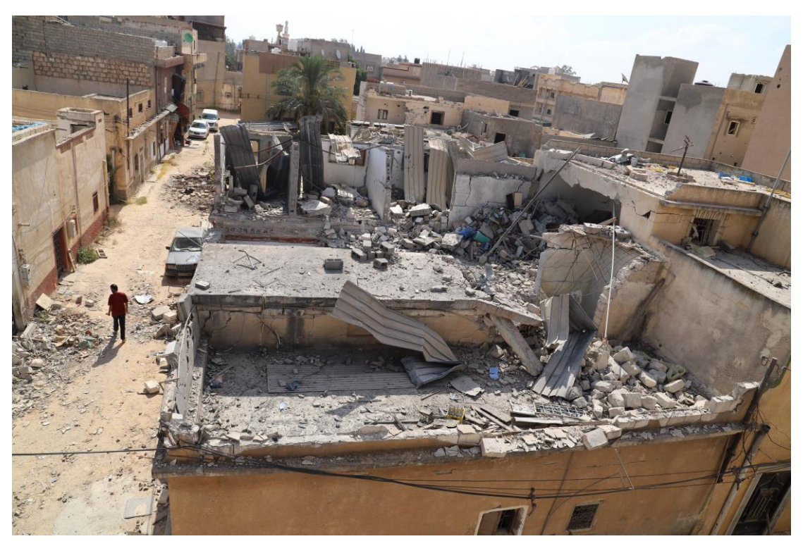
Houses in Qasr Bin Ghashir destroyed by GNA airstrikes on 23 June 2019.

In addition to the current fighting around Tripoli, between the GNA and LNA and their affiliated militias, clashes for control of territory and resources continue in the east and south of the country, among Tebu, Tuareg and Arab armed groups.7