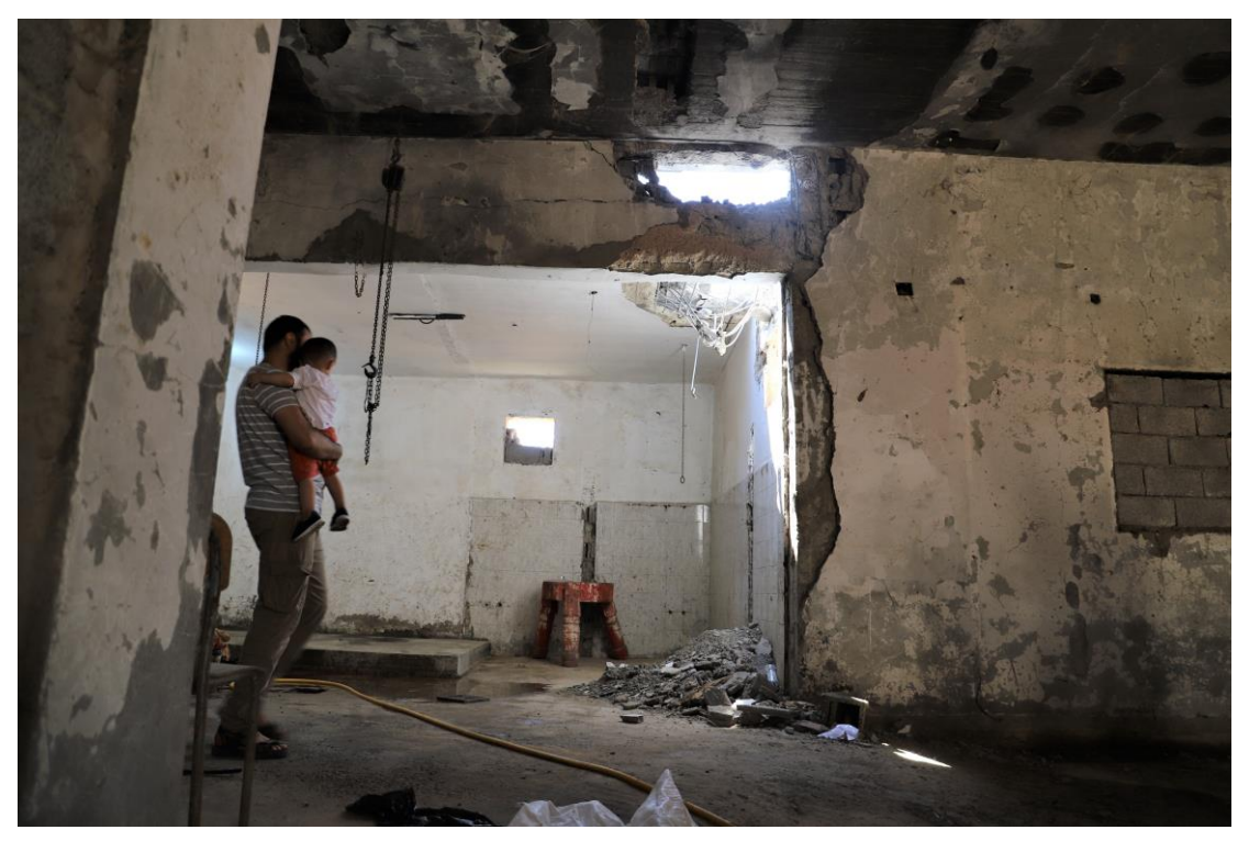
A house in the Souq al-Journa neighbourhood of Tripoli damaged by an artillery strike which injured three civilians on 11 August 2019.