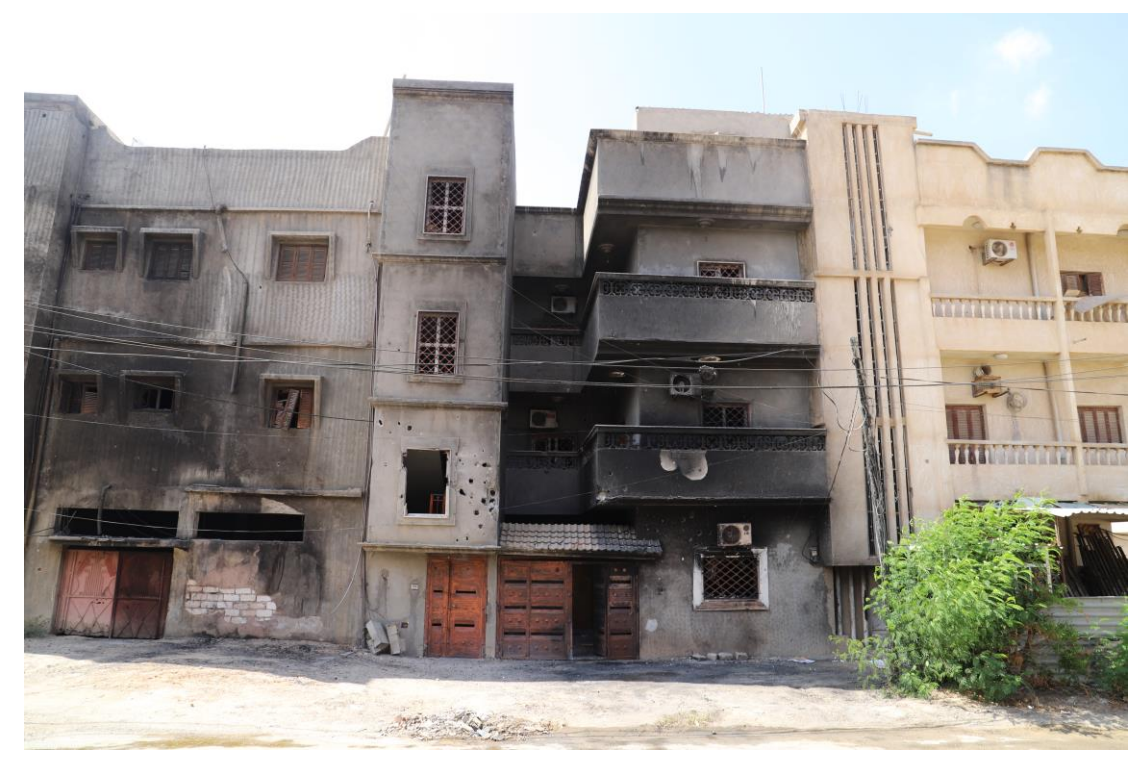
A building in Qasr Bin Ghashir damaged by a GNA artillery strike which killed at least five civilians and injured more than a dozen residents and bystanders in and around the building on 14 May 2019.

"I was at home and my brother was standing outside on the street. The strike was massive; it sent a vehicle flying on top of another vehicle and for a moment everything was black. I rushed outside and there were many neighbours dead and injured on the ground; there were severed body parts. It was a shocking sight. Then we found my brother; he had injuries everywhere; he died. I couldn't believe it".<sup>27</sup>