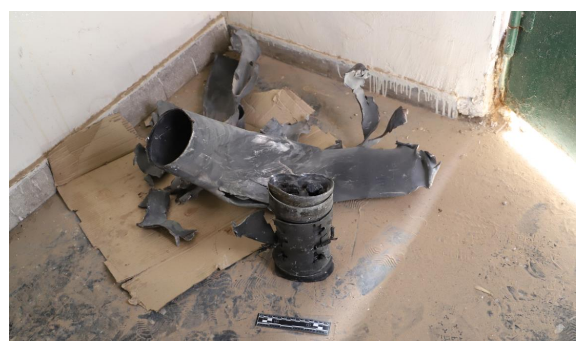
Remain of a Grad rocket fired by the LNA into a residential neighbourhood of Tripoli near Mitiga airport.

Fragments recovered at the scene by Amnesty International investigators confirm that the weapon was a 122mm 9M22U "Grad" rocket.