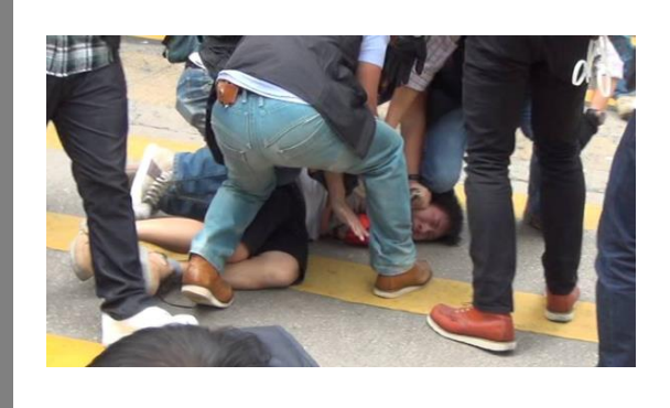
Image clipped from video recorded by the police on 26 November 2014.