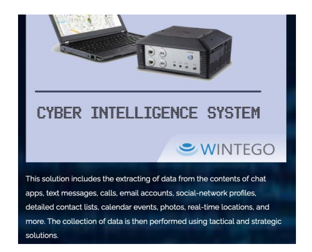
Figure 1: Images from archived versions of the Ataka website

Amnesty International also identified a <u>blog post</u> by an individual self-identifying as an employee of Ataka published on 9 April 2019. The blog post identifies the Indonesian National Police as a partner to whom Ataka supplies "the Helios Android and Tactical Web Intelligence" system. (Wintego's Helios spyware product is unrelated to Intellexa's "Helios" spyware).