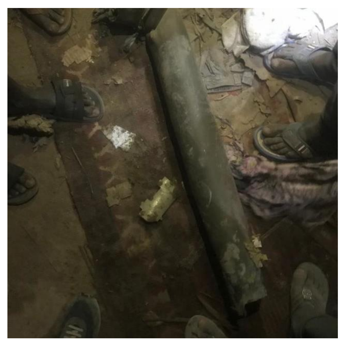
⊕ ↑ Fragment of a piece of a rocket that killed a mother and her two children in their home in the Mayo neighbourhood of Khartoum on 19 April 2023.

In El Geneina, in West Darfur, civilians have been repeatedly killed and injured in their homes because of armed clashes between the RSF and allied Arab militias on one side, and the Sudanese Alliance and other Masalit armed groups on the other side. For all the incidents below, Amnesty International was not able to determine which side fired the munition that caused the civilian casualties.