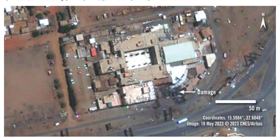
9 \uparrow On 18 May 2023, imagery shows the south side of the hospital has been heavily damaged.

In its letter to the RSF leadership, Amnesty International asked questions about how its forces were making decisions about where to locate themselves when operating in densely populated areas, and about what precautions they were taking to protect civilians from the dangers of their locations and of their operations more generally.